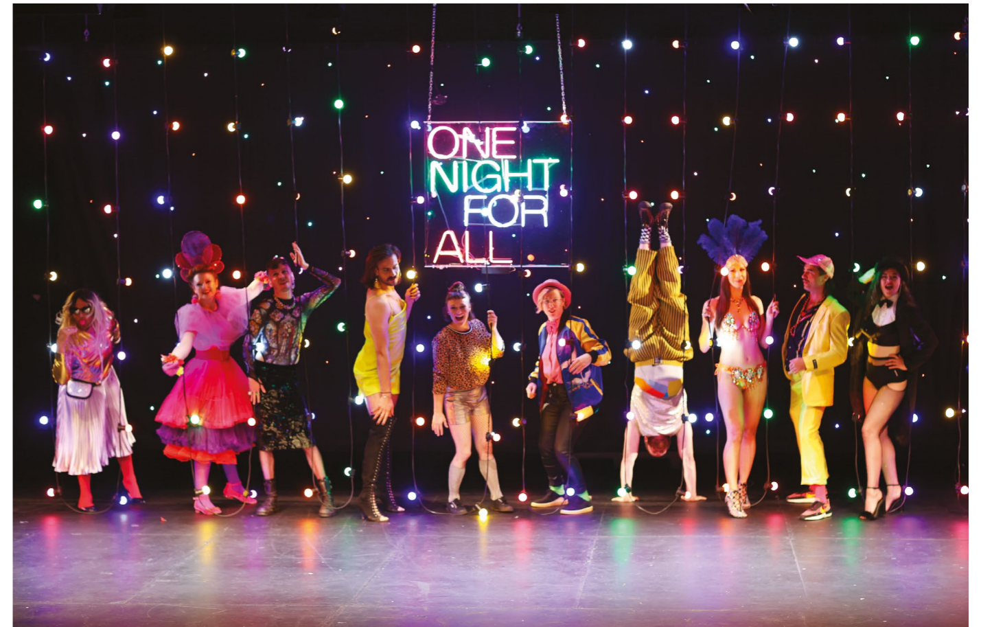
↑ Culture Night Launch 2022. Seoladh Oíche Chultúir 2022.

I ndeireadh na dála, chaith mé formhór mo chuid ama mar Chathaoirleach na Comhairle le linn ghéarchéim Covid-19.