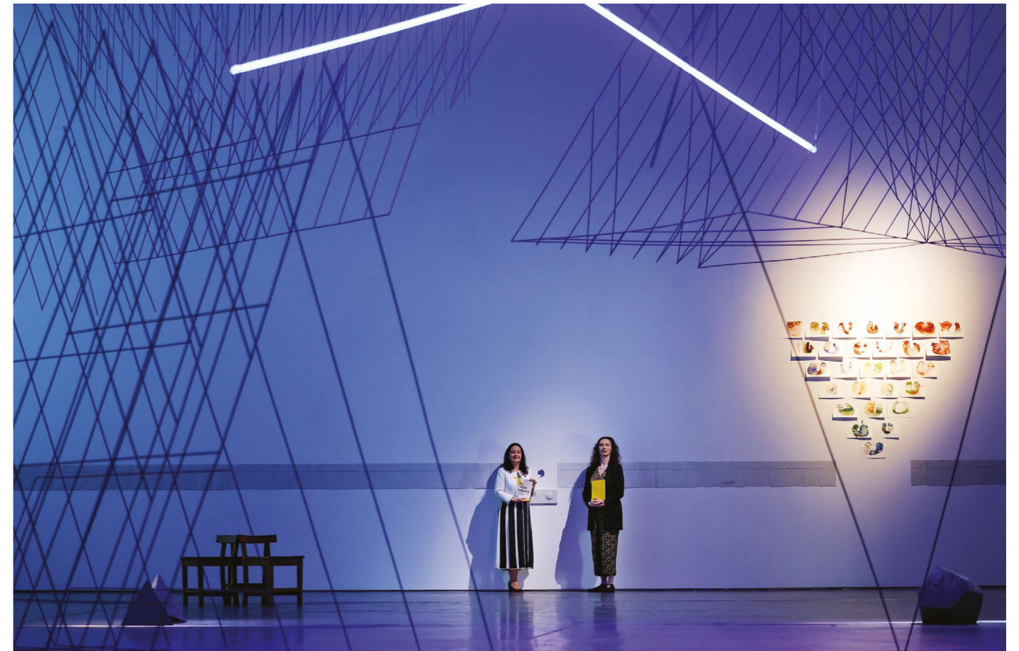
↑ Arts Council. Places Matter . An Chomhairle Ealaíon. Places Matter .

Mar chuid den chomóradh seachtó bliain, rinneadh sraith aistí a