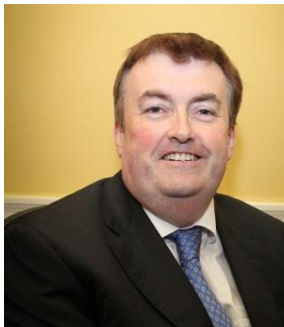
Colm Brophy TD (FG)