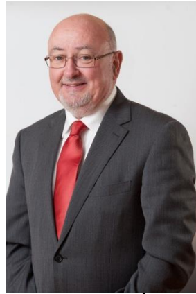
Caoimhghín Ó Caoláin TD (SF) [Chair]